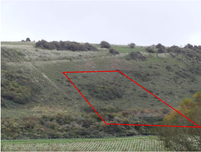
Above: October 2025: the Herdwick sheep have arrived on Mill Hill