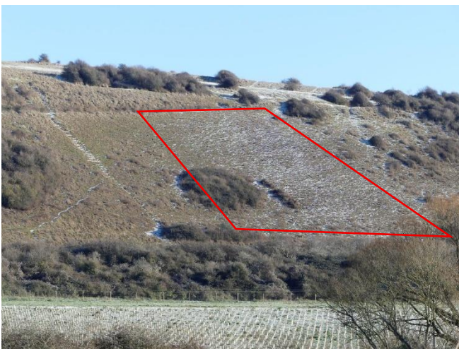
January 2026: Invading plants removed from a third of a hectare.